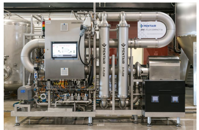
BMF +Flux Compact S4 – Capacity 30-60 hl/h

Click or scan our QR code to contact us or visit us at FOODANDBEVERAGE.PENTAIR.COM