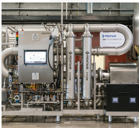
BMF +Flux Compact S4 – Capacity 30-60 hl/h