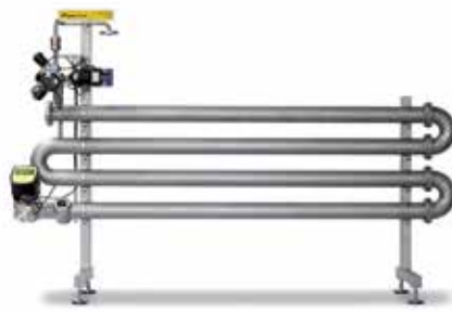
CARBONATION CONTROL SYSTEM