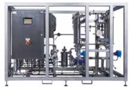
MEMBRANE WATER DEAERATION SYSTEM