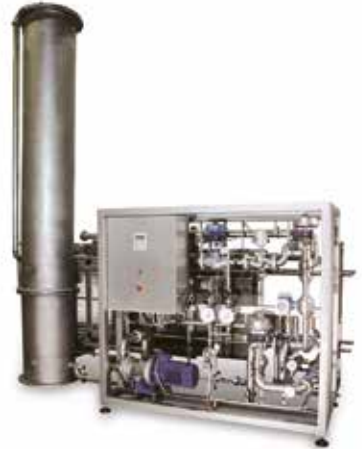
WATER DEAERATION SYSTEM

Many breweries have already implemented the sustainable brewery concept and 'do more with less' today.