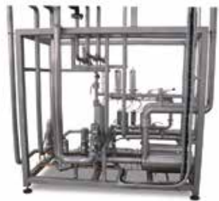
DA-WATER STORAGE/DISTRIBUTION SYSTEM