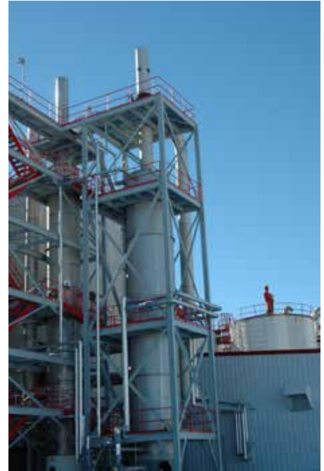
2013 Ethanol Recovery Project